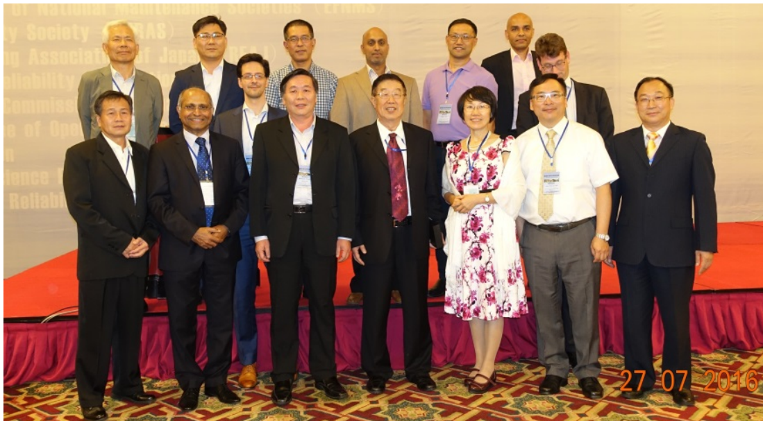
ISEAM Fellows at the Congress

The 11th World Congress on Engineering Asset Management (WCEAM 2016) was held in conjunction with the 2016 International Conference on Quality, Reliability, Risk, Maintenance, and Safety Engineering (QR2MSE 2016) in Jiuzhaigou, Sichuan, China, 25-28 July 2016, and was hosted by the International Society of Engineering Asset Management (ISEAM). The QR2MSE is an annual international conference series which brings together leading academics, industry practitioners, and research scientists from around the world to advance the body of knowledge in quality, reliability, maintenance, and safety of engineering systems, to establish and strengthen the link between academia and industry, to promote applications of research results in practice, and to showcase state of the art of industrial technologies. The QR2MSE international conference was founded in 2011 and has grown admirably through the support of many academic organizations and colleagues, and has become a premier conference in this field in Asia. WCEAM has been held annually since 2006 commencing with the inaugural event on the Gold Coast in Queensland, Australia and has objectives that are well aligned with the objectives of the QR2MSE but addressing the overall multidisciplinary field of Engineering Asset Management. The event attracted 288 delegates from 21 countries.